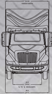
8600 SBA 6x4